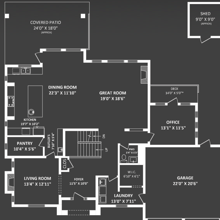
MAIN FLOOR: 1892 SQ.FT.