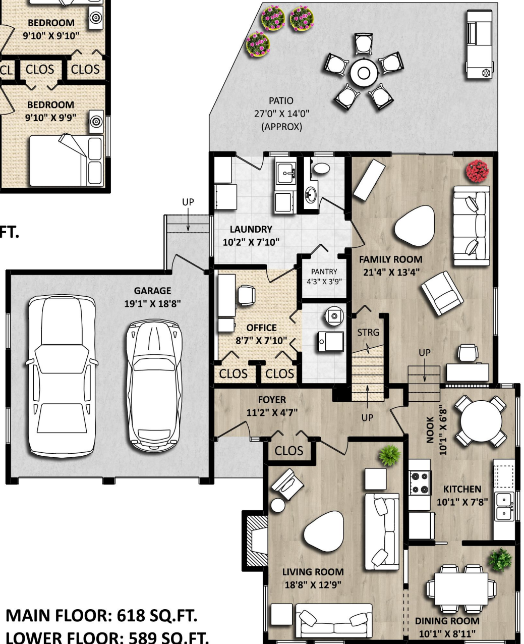
MAIN FLOOR: 618 SQ.FT. LOWER FLOOR: 589 SQ.FT.