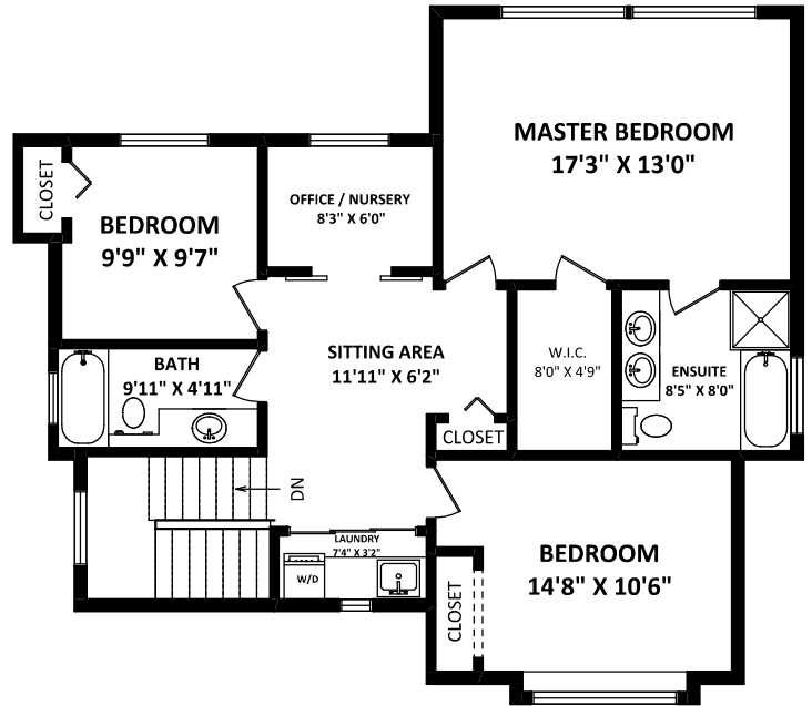
UPPER FLOOR: 1036 SQ.FT.